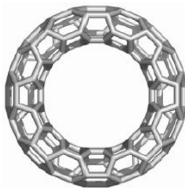
Figure 3. The Zig-Zag Polyhex Nanotorus T[p, q] .